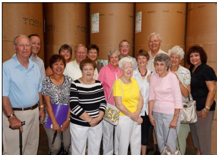
Above: Yesterday's Kids toured the Belleville News Democrat production plant in August. The trip included lunch at Eckerts.

Please consider joining Yesterday's Kids if you or your spouse is 55 or older. They have couples and singles, so don't be shy. They meet the second Monday of each month and always eat and have fun.