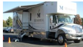
Above: The annual health fair includes the Memorial Hospital Mammography van.