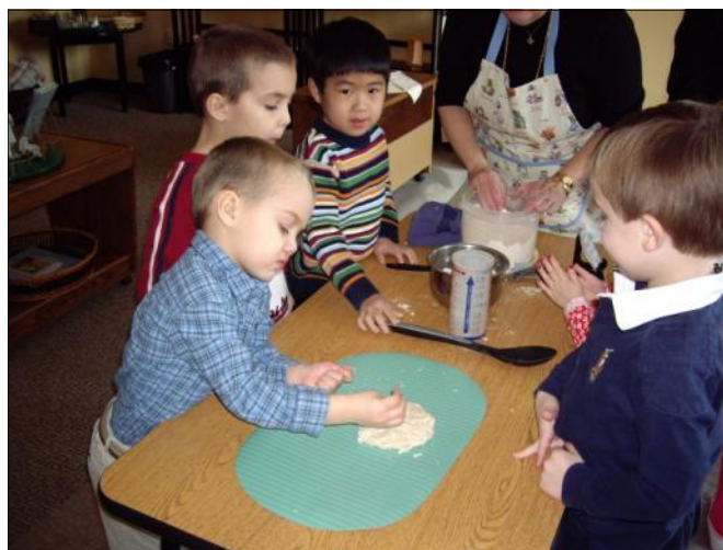
Above: Children learn through hands-on play in the Catechesis of the Good Shepherd program.